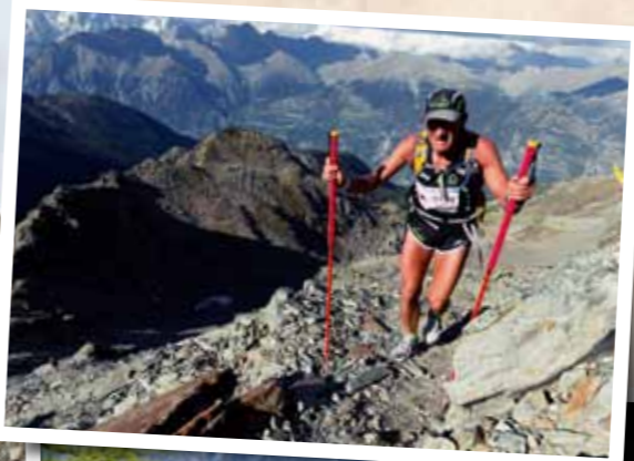
Left, a competitor makes the gruelling climb to the Crosatie Pass, towards Planaval Below, more of the brave – some say mad – participants in last year's Tor des Geants. Notice how they are all smiling? Like we said... brave or mad?